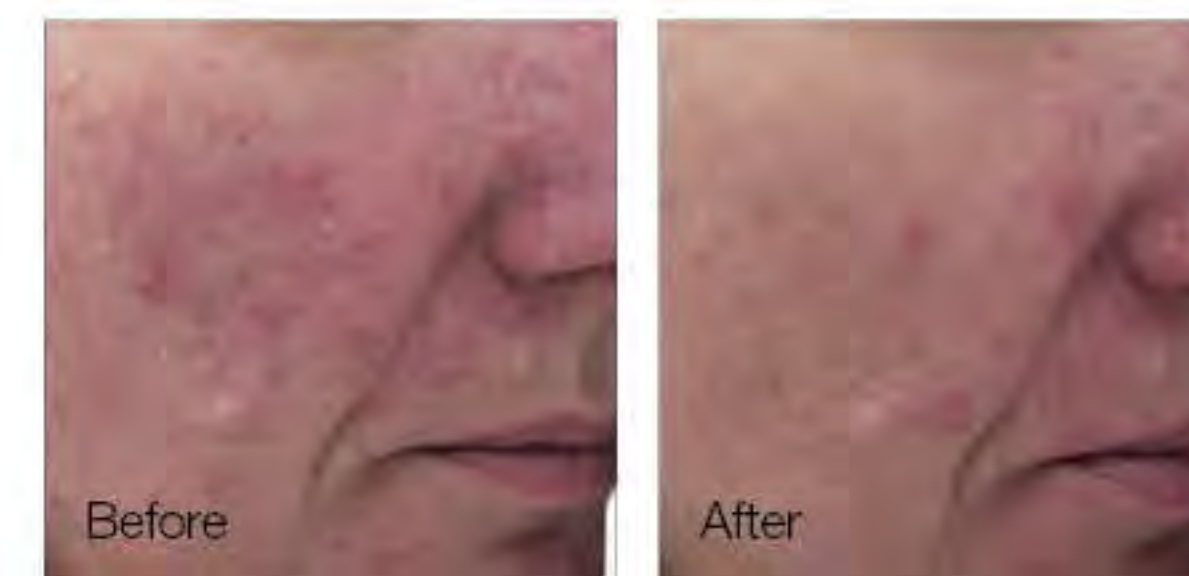
Results after 1 treatment