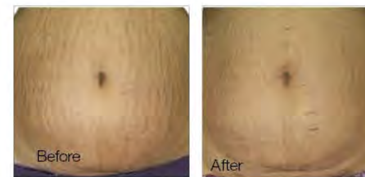
Results after 4 treatments