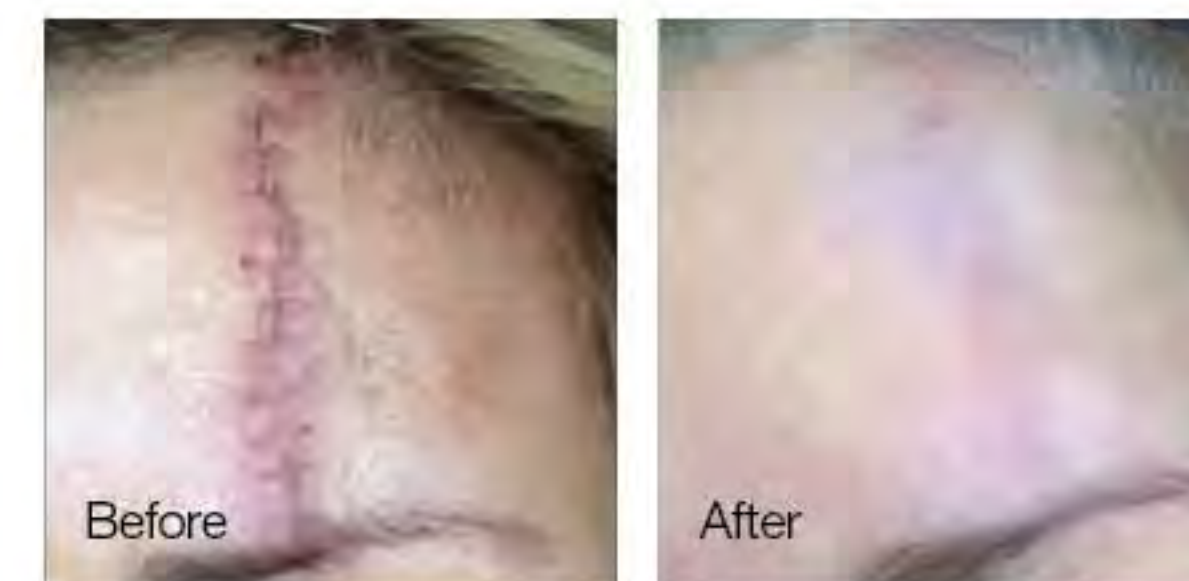
Results after 3 treatments