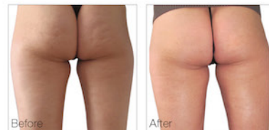
Results after 5 treatments