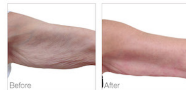
Results after 5 treatments

*Individual treatment results may vary. All photos used are of actual patients from real doctors.