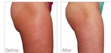
Results after 8 treatments