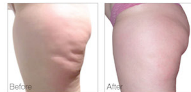
Results after 8 treatments