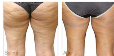
Results after 10 treatments